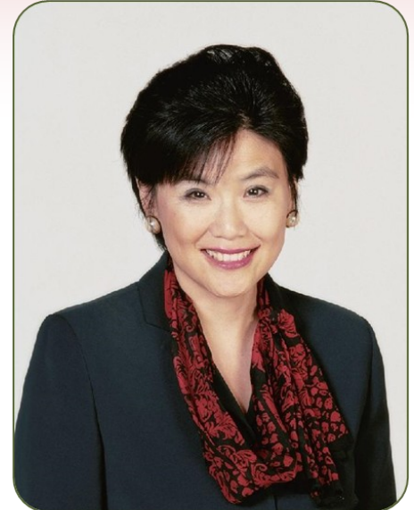
Congresswoman Judy Chu